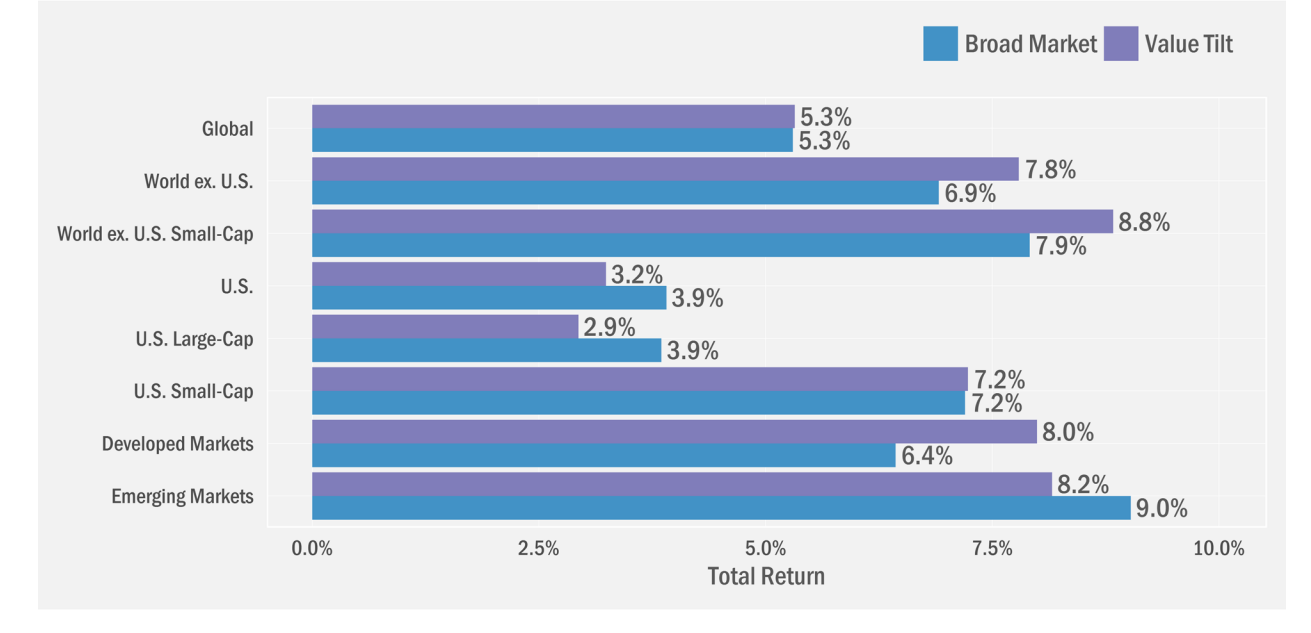
FIGURE 2: Q3 2016 Equity Index Performance

From 06.30.16 to 09.30.16. Past performance is not indicative of future results. One cannot directly invest in an index. Index performance does not reflect the expenses associated with the management of an actual portfolio. Please see additional important information regarding indexes at the end of this report.